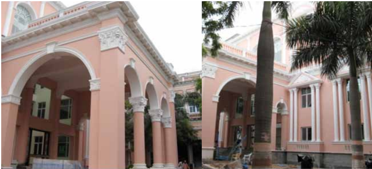
HMDA Annexe II Building