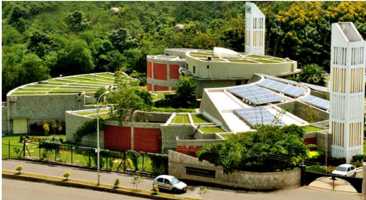
The CII Godrej Green Business Centre was India's first LEED Platinum-certified building.

Early movers that recognize the value of investing in efficient buildings are forging ahead with exciting energy efficiency achievements both nationally and internationally. The following case studies—locally from Hyderabad and internationally from the United States and China—demonstrate that energy efficiency is an achievable and valuable energy source. The studies discuss project descriptions, motivations, barriers, successes, and lessons learned, and can serve to showcase the many benefits of energy-efficient buildings to wider stakeholder groups.