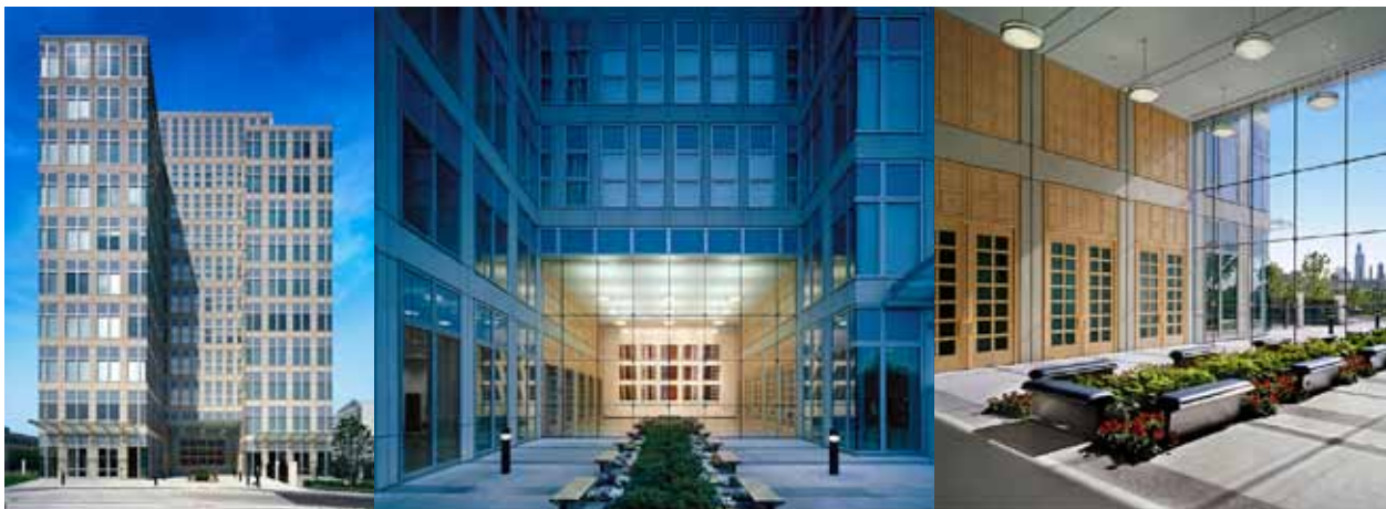
The FBI Chicago Office Building won the Chicago Outstanding Building of the Year (TOBY) Earth Award 2010.

Distinguishing Value: USAA Real Estate Company's average Energy Star rating was 82 in 2008, up from 48 in 2000. USAA has saved more than $12 million as the company works toward the goal of reducing its total energy consumption by 25 percent.