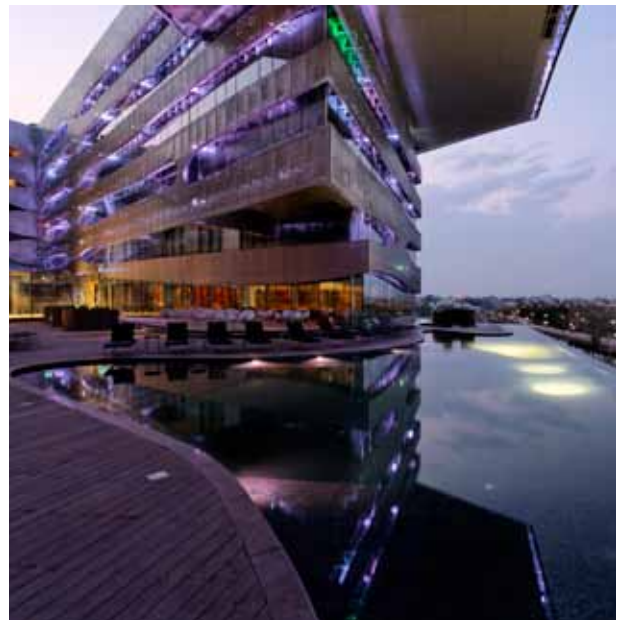
The Park Hotel, Hyderabad

Hyderabad's IGBC-CII Godrej Building started the initial green building movement in India with the first LEED Platinum-certified office building in 2004. Since then several large companies, such as the Park Hotel Group, TCS, Cisco, Infosys, ITC, and Wipro, have lead the top of the market in improving efficient building design in their hotels, IT campuses, and businesses parks. While more movement is needed with large companies at the top of the market, the middle and bottom of the building efficiency market has had limited attention and focus. Adoption of the ECBC by all segments of the market, with special attention to the middle and bottom, is critical to transforming India's buildings into efficient ones. The three Hyderabad case studies highlighted below examine efficient buildings at various local levels, including a government building, a multinational company's campus, and a local developer's project.