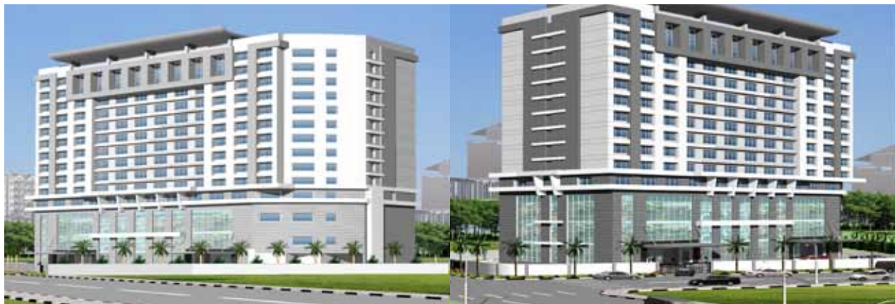
Views of the Aditya Sarovar Premier Hotel.