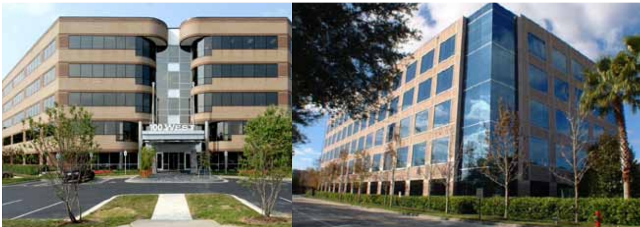
100 West Road in Baltimore, Maryland, and Maitland Promenade in Orlando, Florida.

Monitoring and Verifying Energy Savings: Energy usage and costs are tracked on an ongoing basis in Energy Star Portfolio Manager to ensure that savings achieved are maintained and to work toward continuous energy performance improvement. To promote energy awareness and best practices, each property distributes tenant newsletters that describe energy goals and accomplishments.